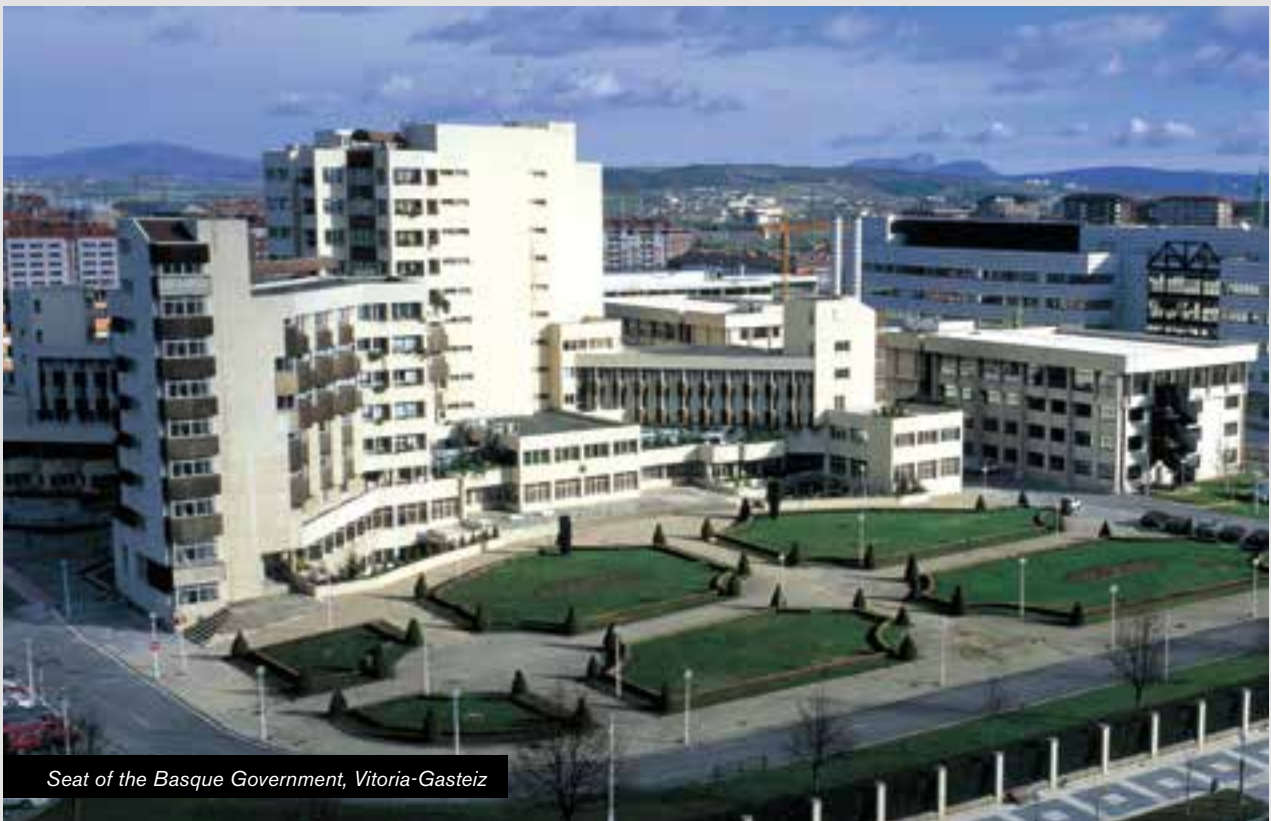
Seat of the Basque Government, Vitoria-Gasteiz

on its own budgets and on agreements signed with the Spanish central administration. All these circumstances have enabled the creation of local organisations, such as EITB - Basque Radio and Television; the Ertzaintza, the autonomous police force, with more than 7,000 agents, and full authority over road and hydraulic infrastructure, economic and industrial promotion, territorial planning and training.