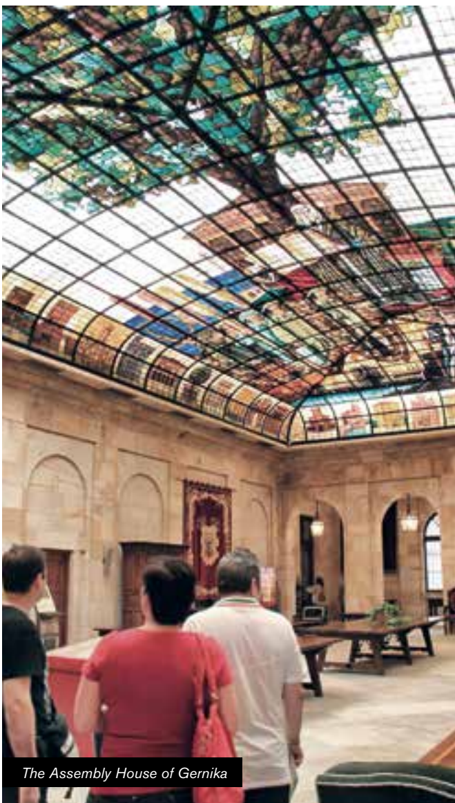
The Assembly House of Gernika

BIGlittle Basque Country expresses the strength and energy of this small country, with its natural inclination to tackle the most complex challenges and with performance indicators above the European average.