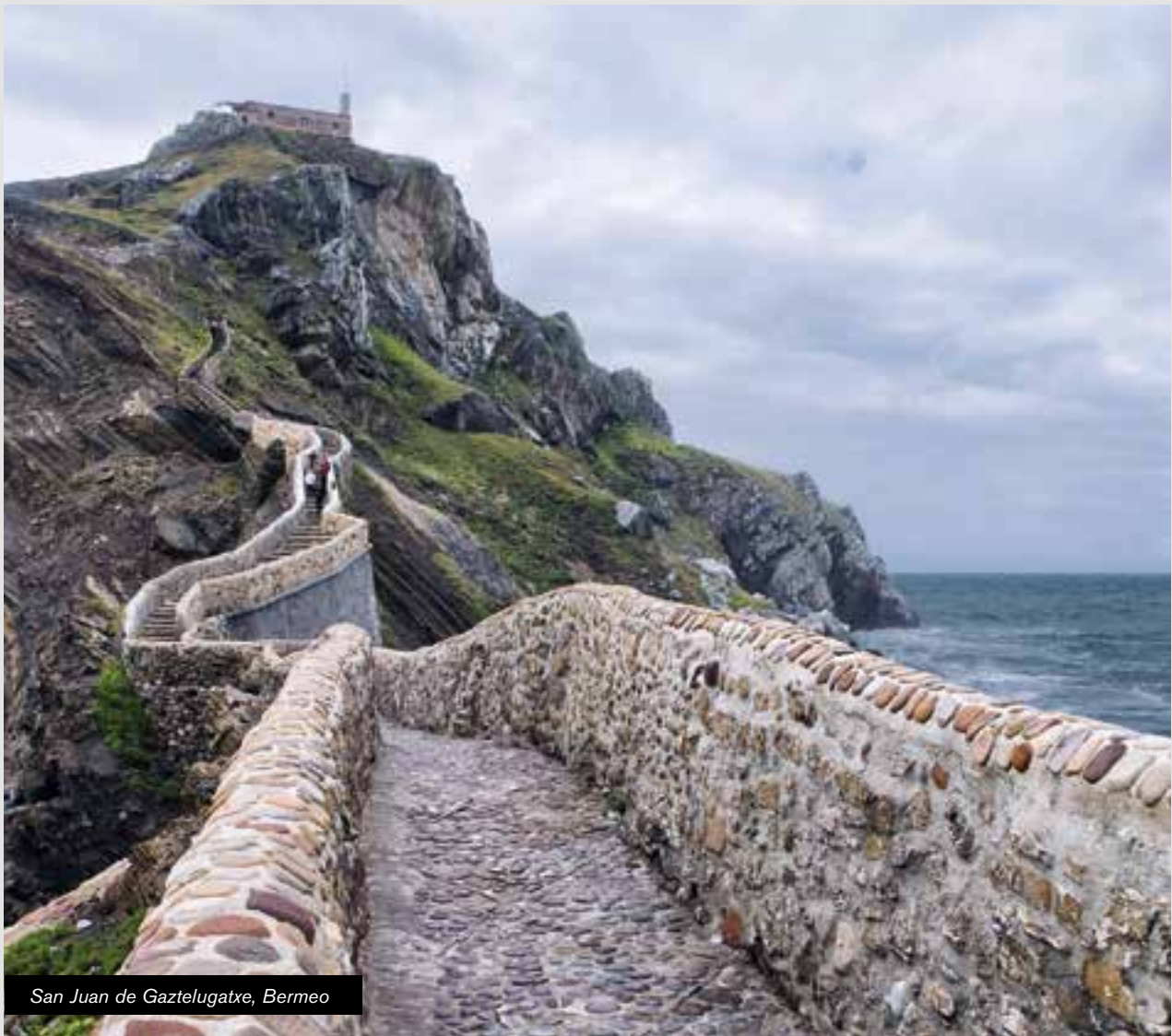
San Juan de Gaztelugatxe, Bermeo

BIGlittle Basque Country expresses the strength and energy of this small country, with its natural inclination to tackle the most complex challenges.