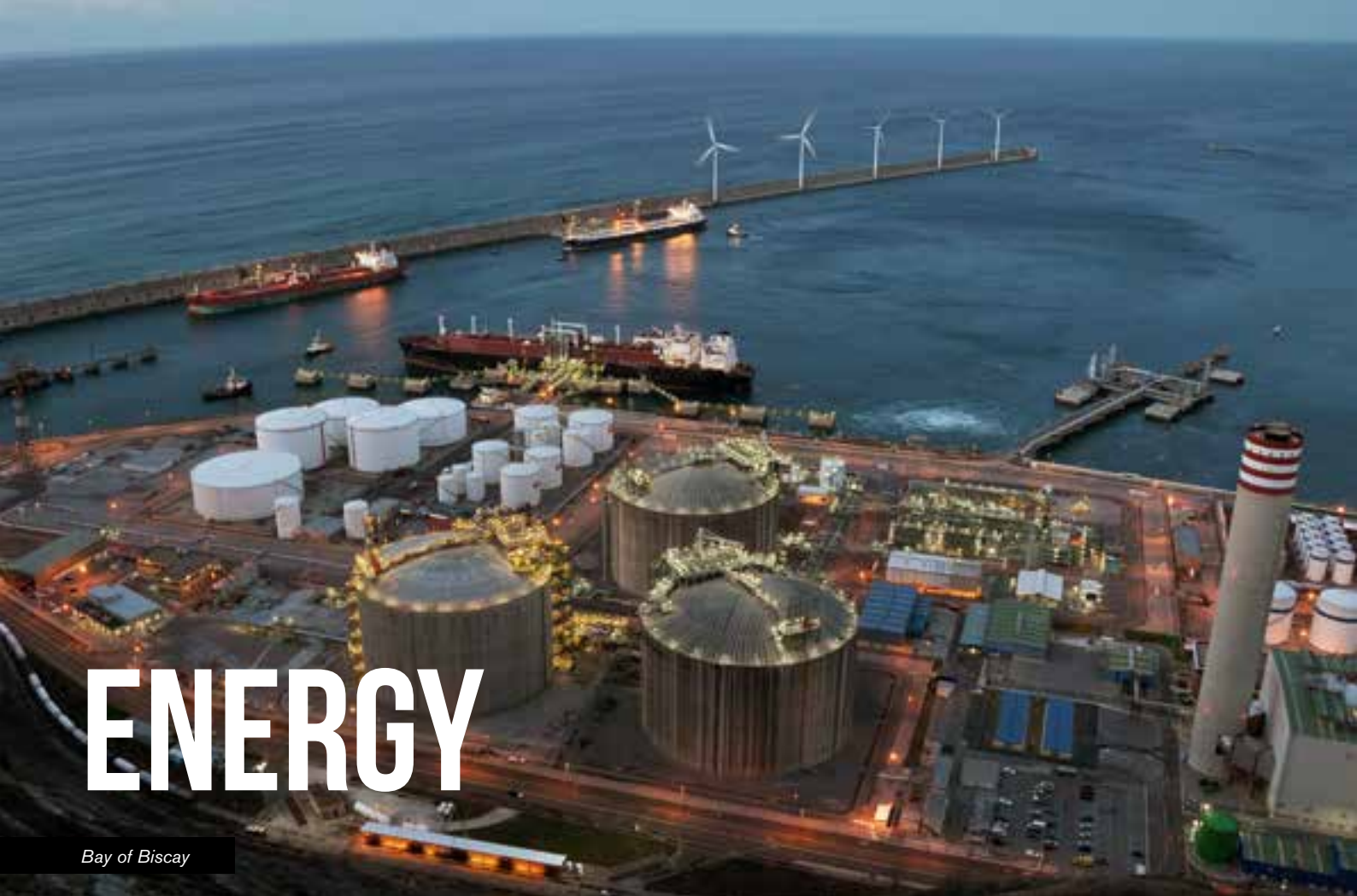
Bay of Biscay