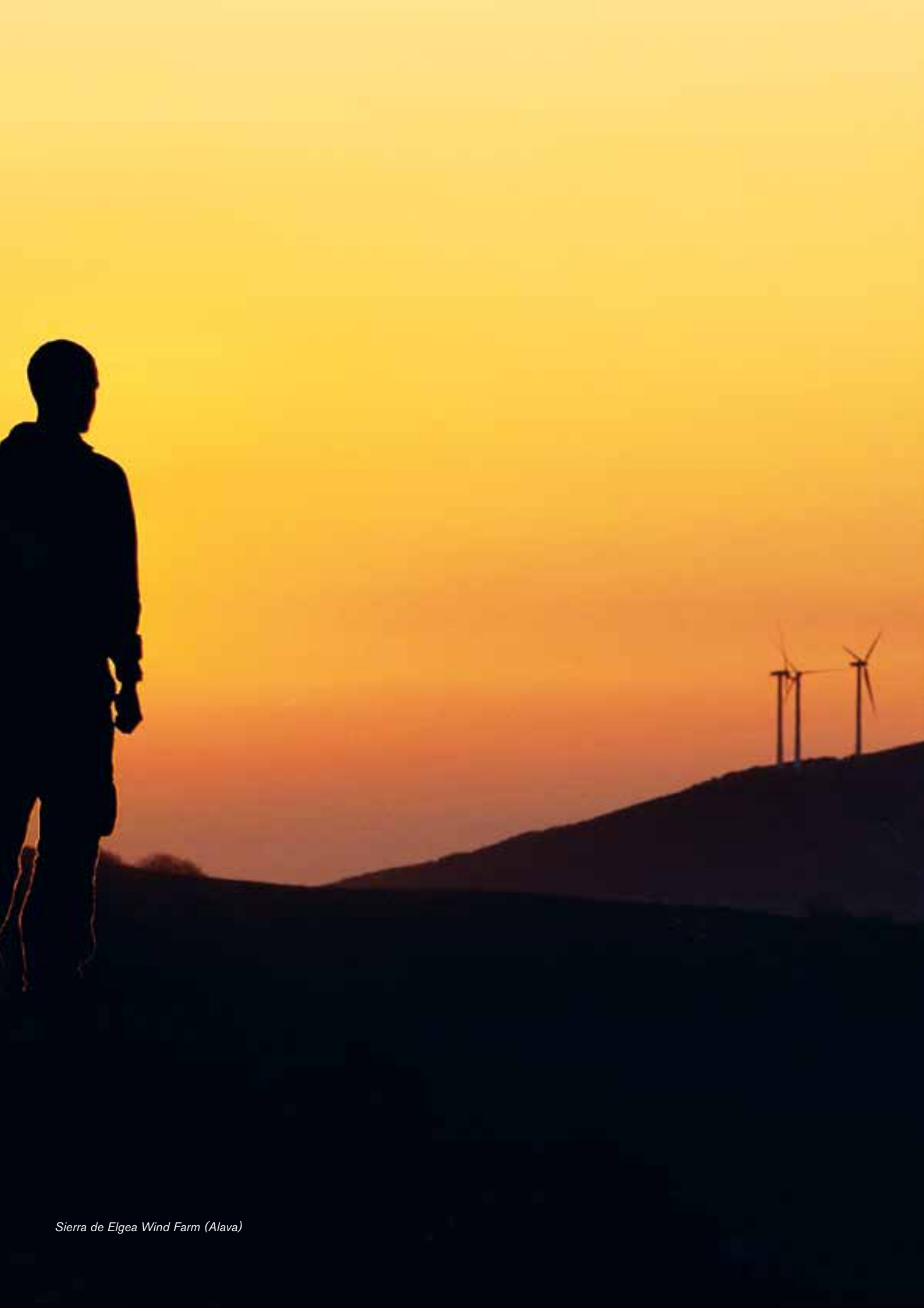
Sierra de Elgea Wind Farm (Alava)