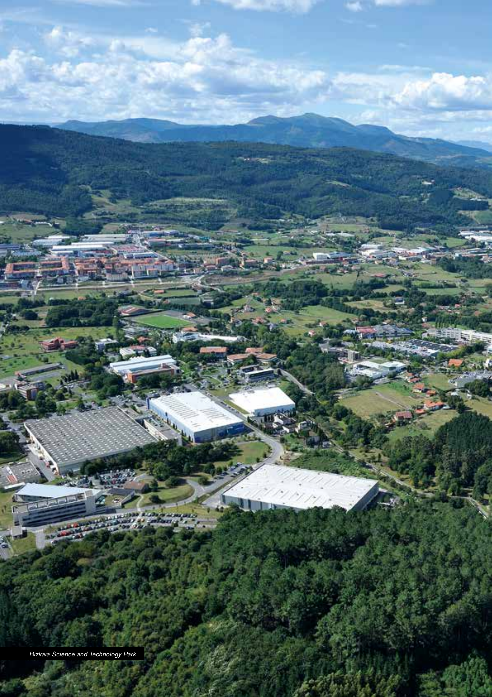
Bizkaia Science and Technology Park