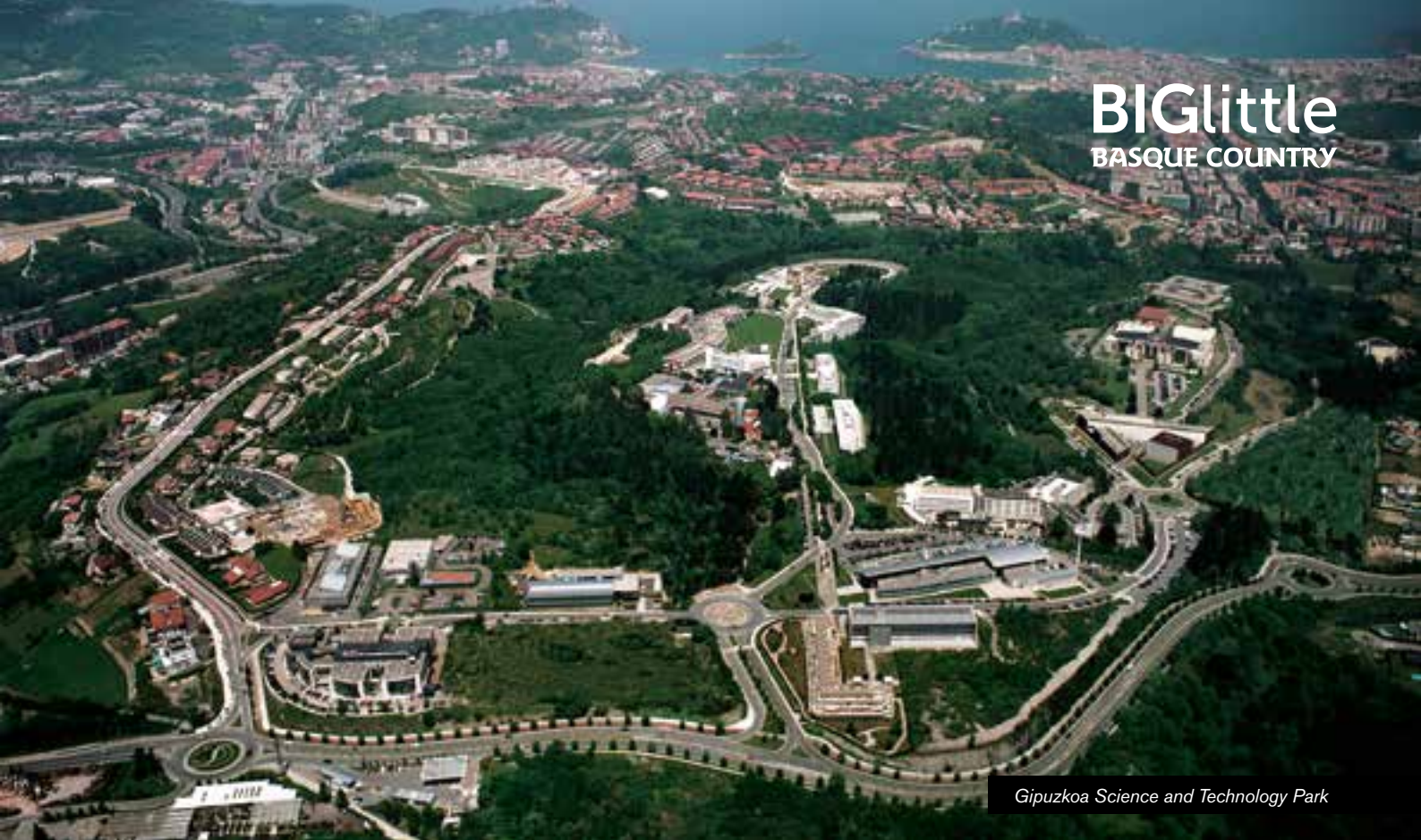
Gipuzkoa Science and Technology Park

The Basque Country, Best Medium-Sized European Region in Connectivity (Financial Times 2016), represents one of the largest industrial concentrations in Spain and its quality levels place it at the forefront of Europe.