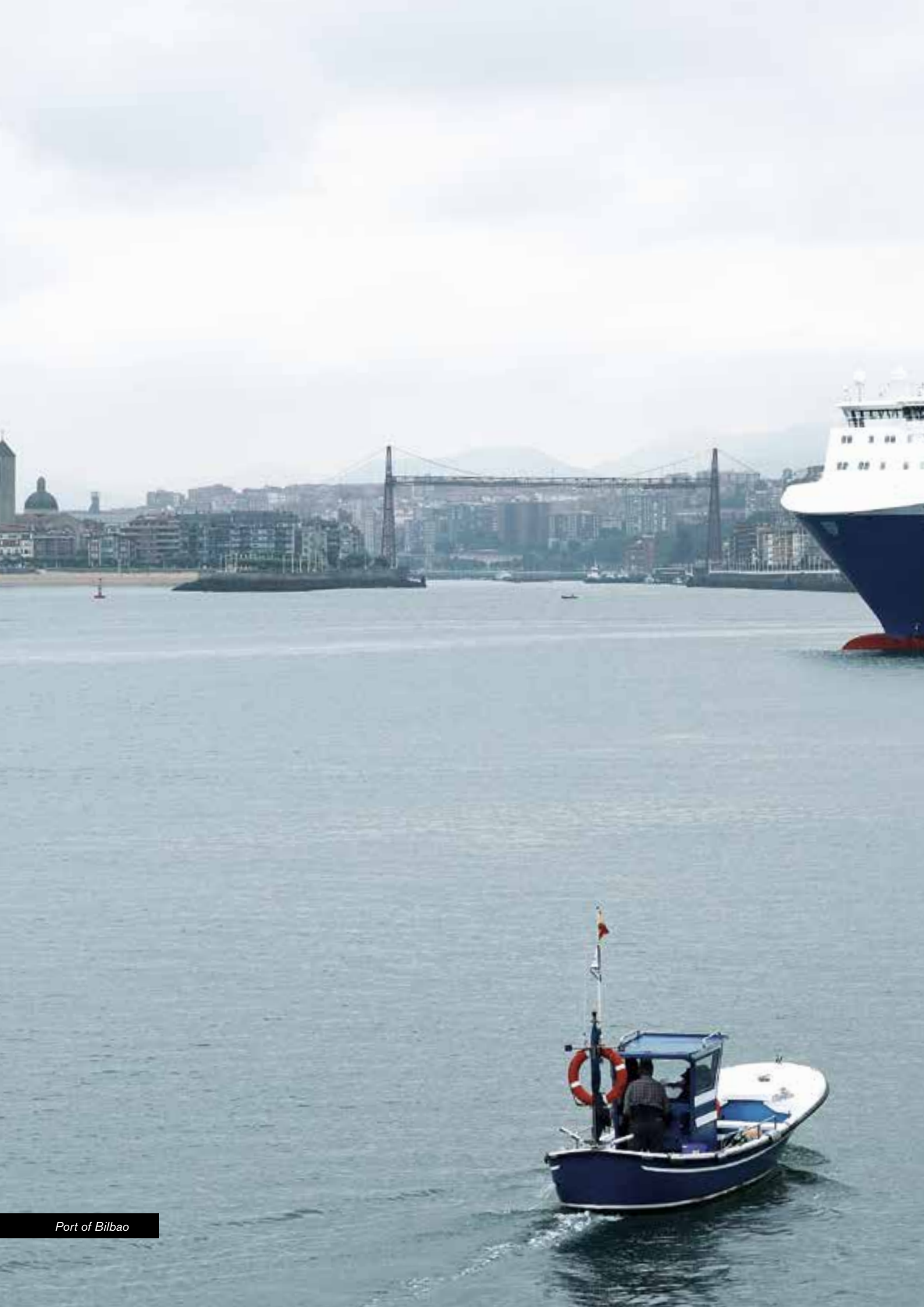
Port of Bilbao