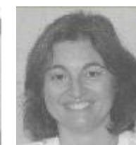
Blanca Suárez Temas